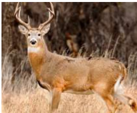
White Tailed Deer

We may not see animals outside, but there are many signs that they are nearby. We may hear a bird call, find and feel fur from an animal shedding its winter coat, or see chew marks on a piece of wood. Use the blank lines and see if you can add to our list below. These are all animals you can find signs of near the Red River!