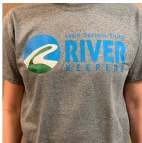
River Keepers T-Shirt $15

Want to support River Keepers and maybe get some awesome swag in the process? Our online shop is filled with T-shirts, rain barrels, and other River Keepers items to show your support in style. Proceeds help us reach our vision that all people value our Red River as a vital part of our community.