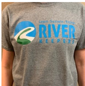
River Keepers T-Shirt $15

Want to support River Keepers and maybe get some awesome swag in the process? Our online shop is filled with T-shirts, rain barrels, and other River Keepers items to show your support in style. Proceeds help us reach our vision that all people value our Red River as a vital part of our community.