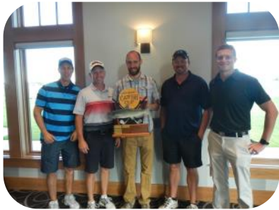
2017 Catfish Cup Winners - Cass County Electric Coop

Catfish Cup - Lowest Team Score Carp Award- Highest Team Score