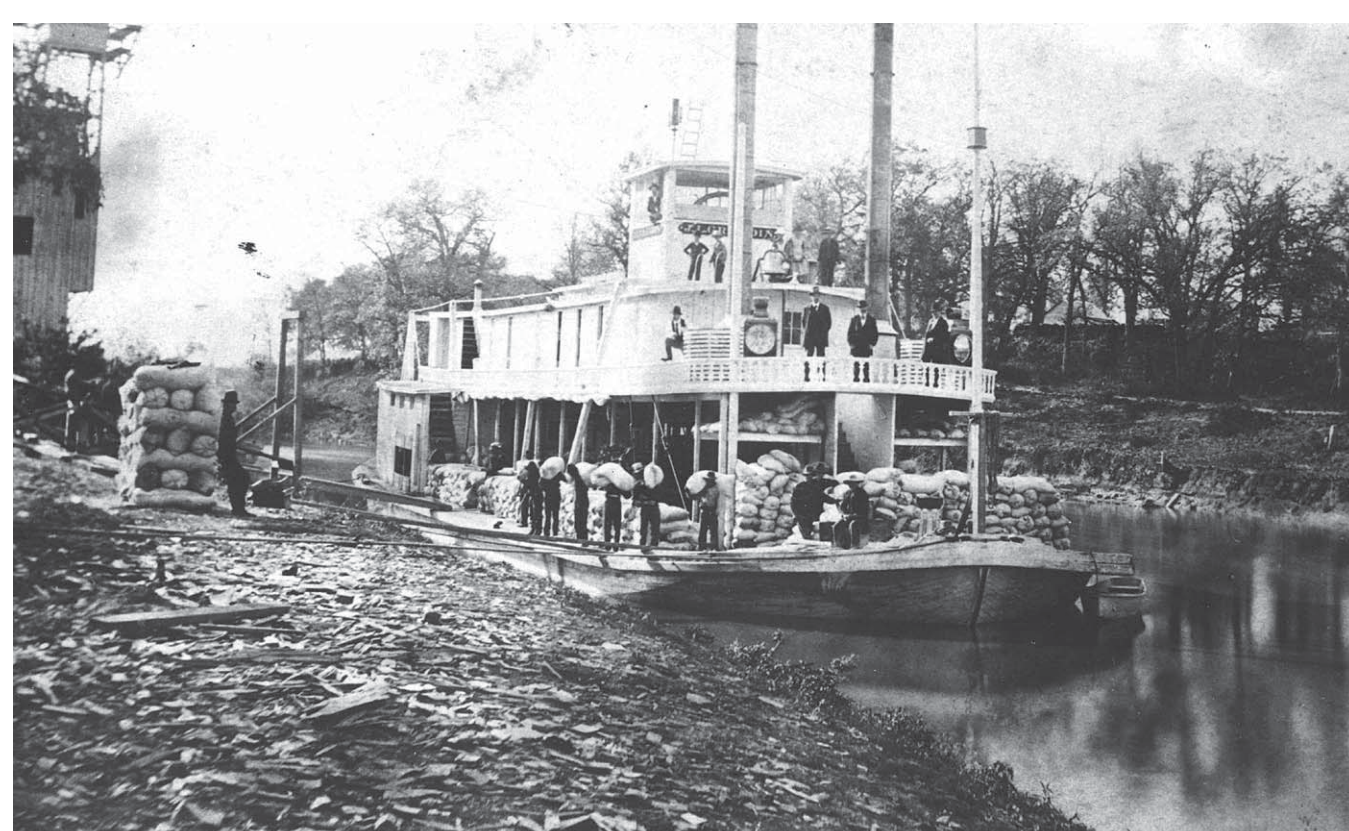
Above: The J.L. Grandin taking on wheat in the southern valley.