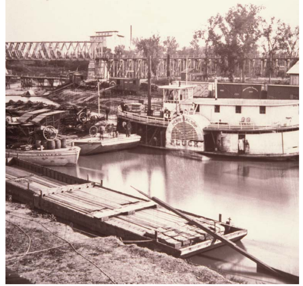
Left: The Pluck, a steamboat. Historical & Cultural Society of Clay County.

While steamboats could not compete with the railroad there were new farmers along the Red with wheat that needed to be transported to the railhead. Steamboaters turned to short-hauling grain, lumber and other wares. In 1878, the huge Grandin bonanza wheat farm near Halstad, Minnesota, built the J.L. Grandin. It hauled wheat to their elevator in Fargo. Within a few years the railroad built branch lines up and down the banks of the Red and steamboating once again could not compete. Steamboats operated near Grand Forks until about 1910 but the big boats in the southern valley quit running about 1886. (Mark Peihl, Historical & Cultural Society of Clay County)