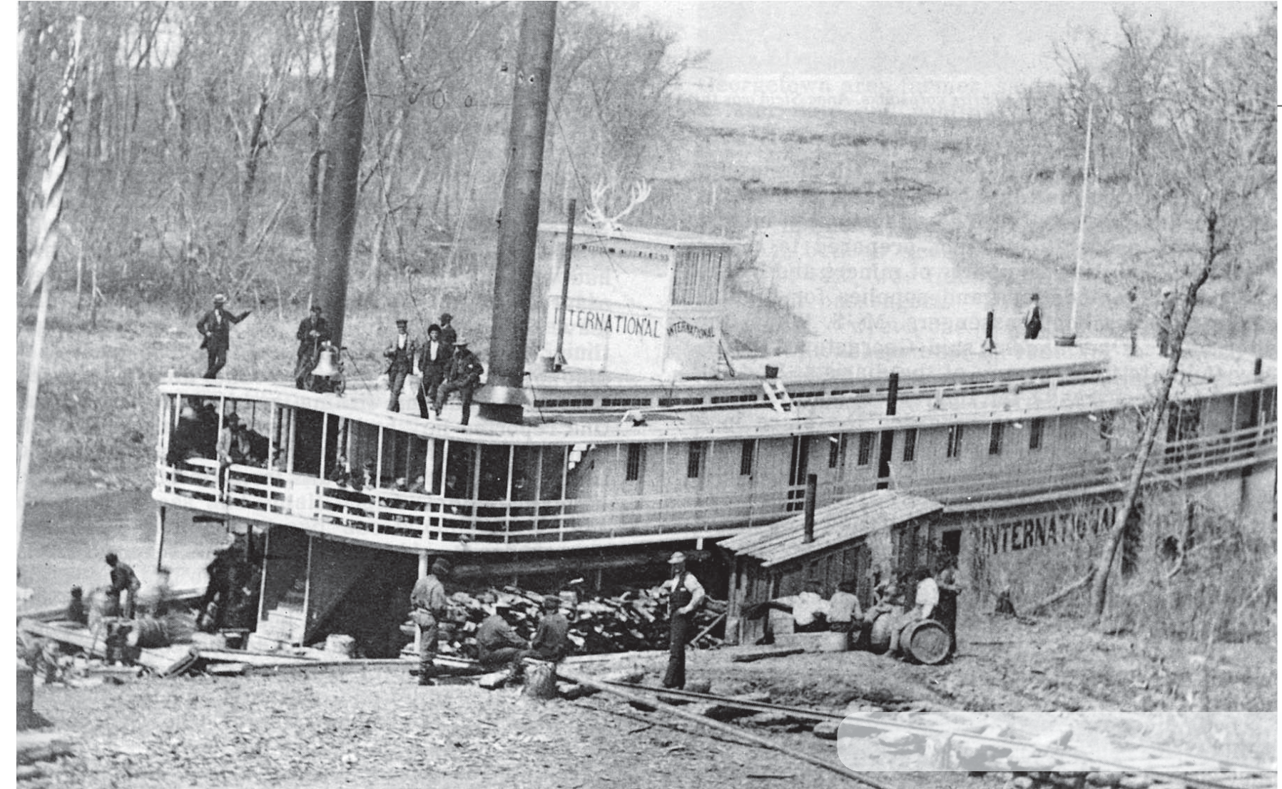
Above: The steamboat, International, on the Red River.

In the 1850s, St. Paul and Fort Garry were the two largest settlements in the area. Minnesota merchants used horse or ox drawn Red River carts to ship goods for sale to their northern neighbors. The carts were cheap but slow as the 500 mile, one way, trip took a month. A steamboat on the Red could cut that time in half.