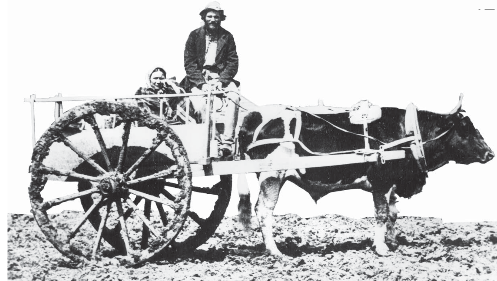
Above: A Red River cart.

With the development of the automobile in the 20th century Interstate-29 was built. It runs north to south through the valley. Trucks now carry merchandise from Winnipeg to Fargo-Moorhead in one day. The trip by steamboat took many days.