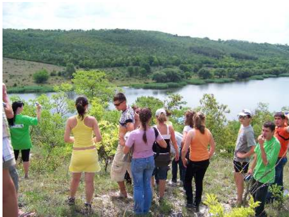
Summer School students overlooking the Dniester River.

Eco-TIRAS and its member NGOs also organize a Summer School program which includes workshops about sustainable development, conflict resolution, NGO establishment and management, biomonitoring of waters, botanic and entomologic excursions, ecology, tourism, organic farming, canoeing, and developing strategies for the rural communities of Moldova. Summer School ends with a Dniester River Festival in the Village of Cioburciu, Slobozia region. Numerous students between the ages of 16 and 22 compete to be one of the 80 participants in this premier nature program. The students come from various villages and cities in Moldova and Transnistria, a breakaway province. Even though their home governments may have political differences, the students recognize that together they share the waters of the Dniester River.