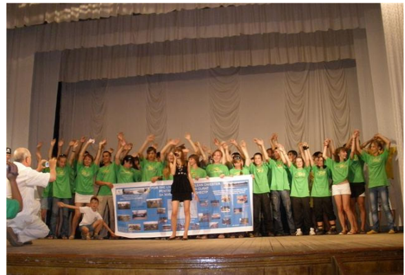
Summer school students singing a song they wrote about the Dniester River at the River Festival.