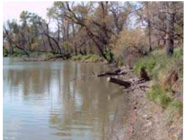
Hanson Design Associates

Efforts this year will include: trees will be planted along the first 50 feet of the riparian area to begin the riverfront restoration, a storm water and how residents affect water quality interpretive display will be designed