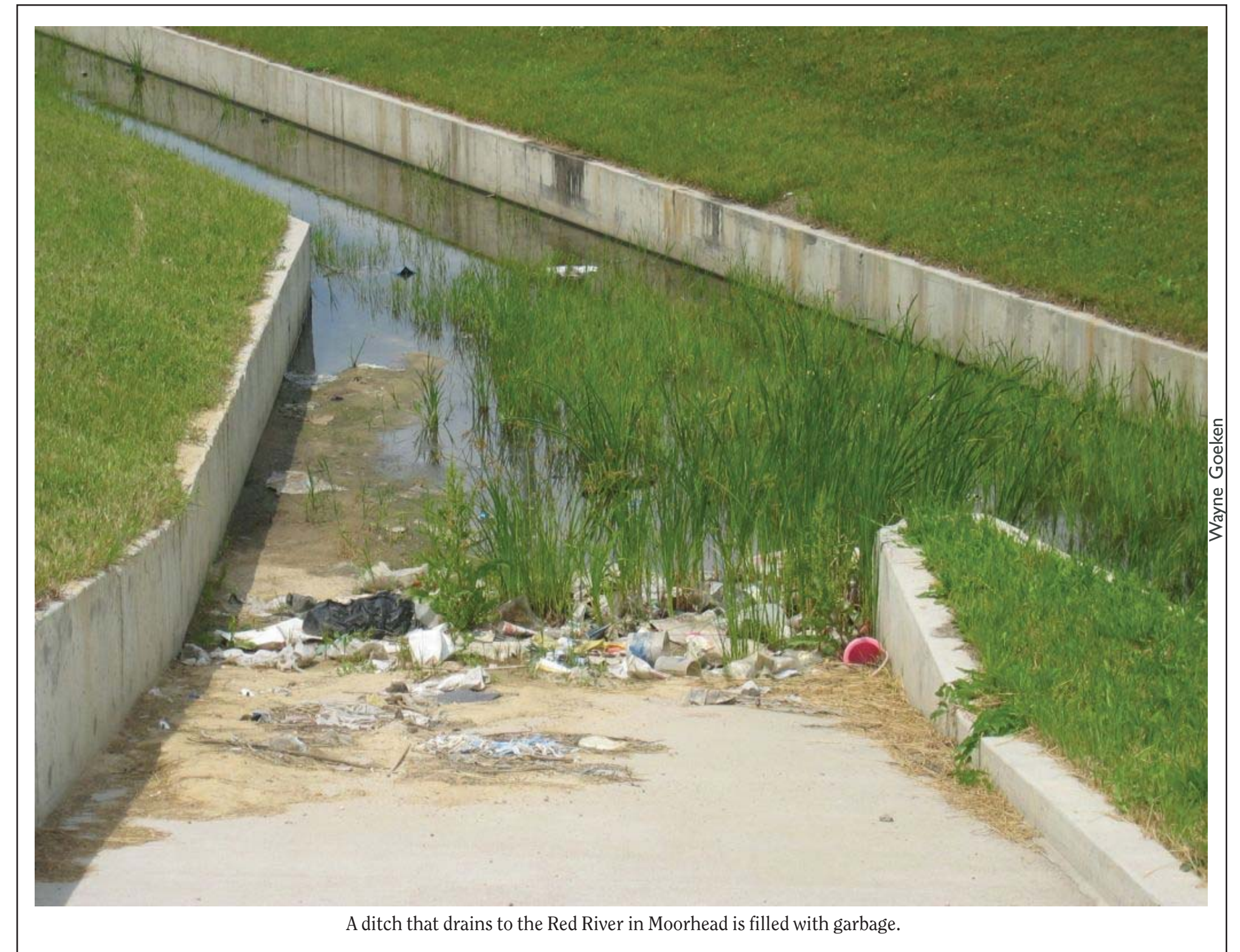
A ditch that drains to the Red River in Moorhead is filled with garbage.

Point source pollution is where pollution enters the water from a specific source such as a factory or wastewater treatment plant. All other types of water pollution are called "nonpoint source pollution" or "polluted runoff." These pollutants fall from the sky and wash from the land during rain storm. Some even get dumped into storm drains or directly into the water by local residents. The United State Environmental Protection Agency considers nonpoint source pollution the number one threat to water quality in the United States.