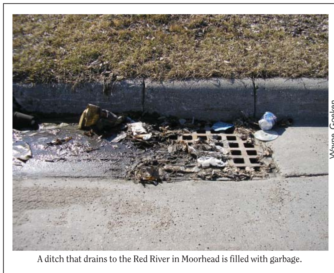
A ditch that drains to the Red River in Moorhead is filled with garbage.