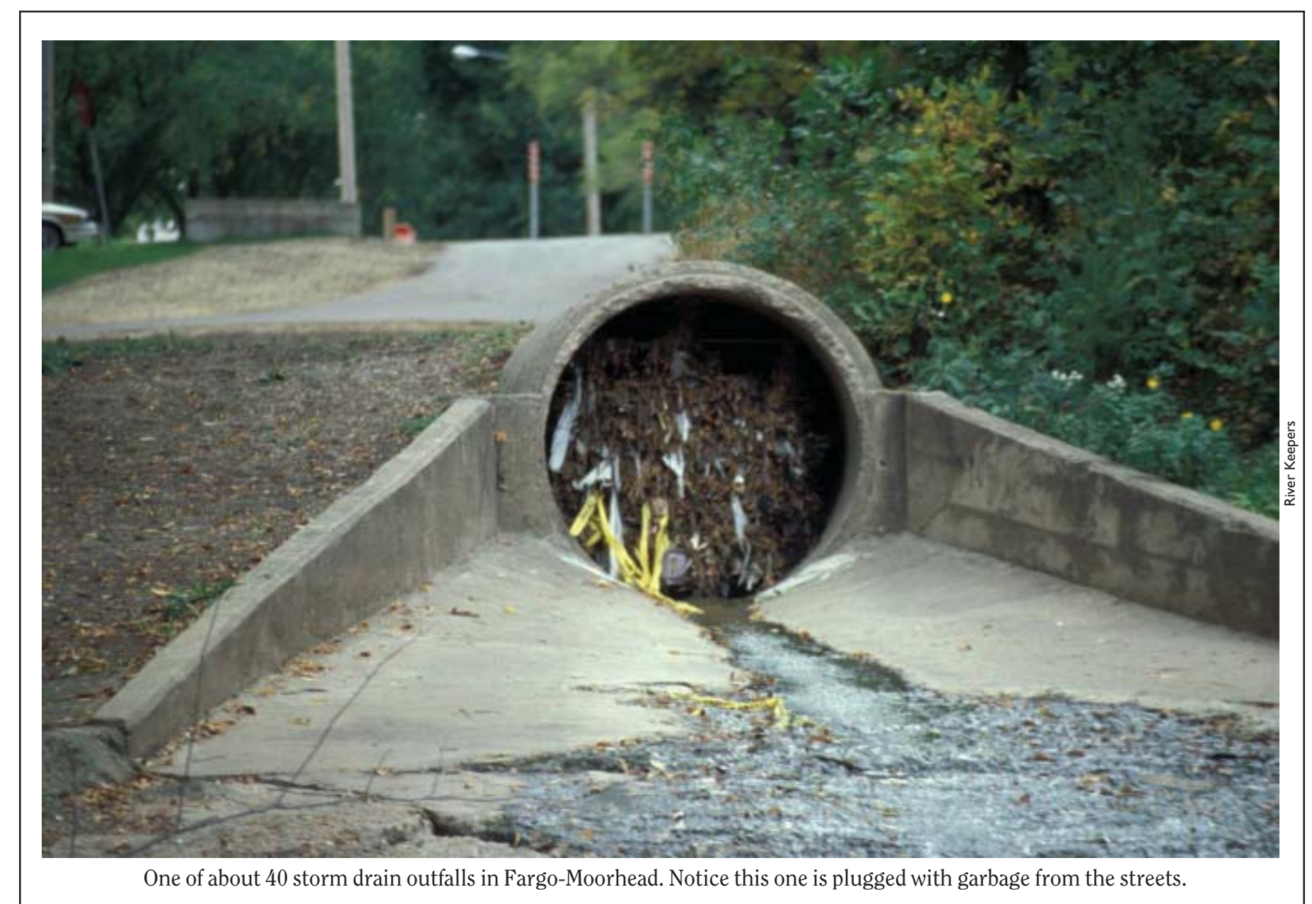
One of about 40 storm drain outfalls in Fargo-Moorhead. Notice this one is plugged with garbage from the streets.