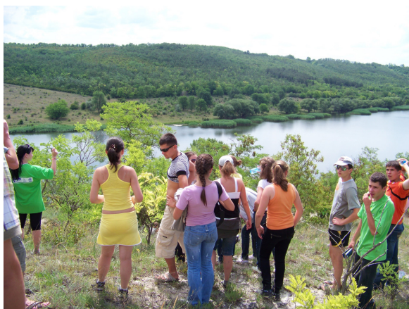
Summer School students overlooking the Dniester River.

Eco-TIRAS and its member NGOs also organize a Summer School program which includes workshops about sustainable development, conflict resolution, NGO establishment and management, biomonitoring of waters, botanic and entomologic excursions, ecology, tourism, organic farming, canoeing, and developing strategies for the rural communities of Moldova. Summer School ends with a Dniester River Festival in the Village of Cioburciu, Slobozia region. Numerous students between the ages of 16 and 22 compete to be one of the 80 participants in this premier nature program. The students come from various villages and cities in Moldova and Transnistria, a breakaway province. Even though their home governments may have political differences, the students recognize that together they share the waters of the Dniester River.