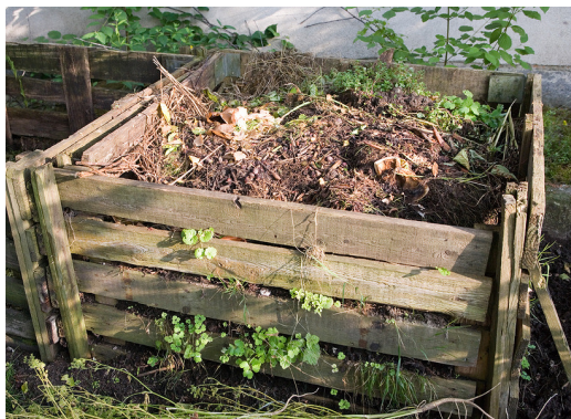
Example of open container

Compost Containers: The two basic kinds of composters are open bins and enclosed containers. Open bins are very simple and loosely encase the compost pile. They usually do not have a lid. They can be constructed with wood, chicken wire, or recycled plastic. Enclosed containers for composting include upright box-like containers and rotating drums that completely enclose the compost pile.