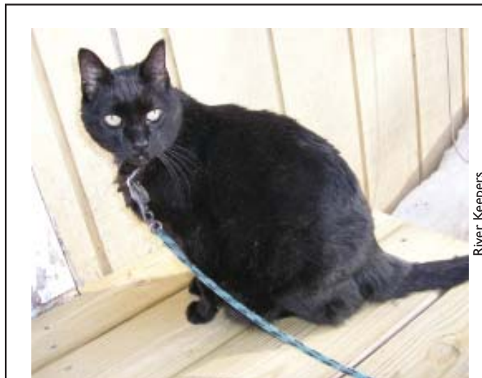
Cat on leash.

Cat predation bears no resemblance to natural predation. Cats are introduced domestic species and have been able to establish themselves at densities that dwarf all other similarly sized predators combined. Unlike native predator species, studies have shown that domestic cats will continue to hunt regardless of whether they are well fed or not.