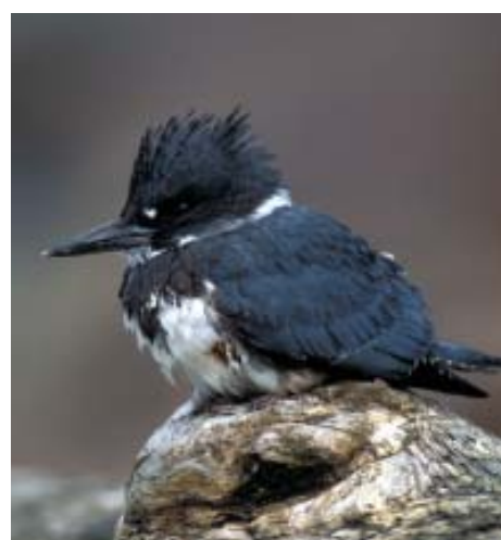
Alaska Maritime National Wild

One of the most common warblers in the United States is the yellow warbler. It is an all yellow bird with reddish/brown streaks on its breast. It also has a dark eye that contrasts with its yellow body. As with all warblers it is a good vocalist. Listen for its distinctive song of “sweet, sweet, sweet, I’m so sweet”. It prefers riparian habitat so look for it among the mature deciduous trees along the river.