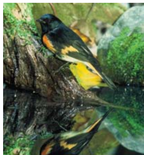
U.S. Fish and Wildlife Service

Swallows are characterized by their slender bodies with long, pointed wings. They are very acrobatic, feeding with dart-like movements almost exclusively in mid-air. Tree swallows who are dark iridescent blue above and white below can be found flying higher over the river. Also, look for them in their nest holes in the dead trees on the riverbank.