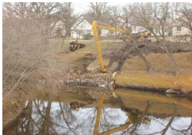
Red River Riparian Project restoration site at Wild Rice River.

The condition of the banks of the Red River vary considerably along its 550 mile course. Geologically, the Red River is quite young at only about 10,000 years old. Because of its youth, the Red River, as all rivers do, is cutting its path through a floodplain. However, the floodplain of this river is an abandoned glacial lake bed. The lake bed is extremely flat and