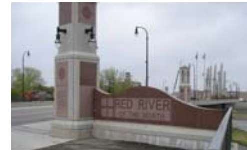
Main Avenue Bridge

In 1990, the RUDAT Study identified the need to connect the urban community to the Red River. Since then, River Keepers has been involved in many projects that move us closer to that goal. The recently completed Main Avenue Bridge project has several features that meet our objectives. They include interpretive plaques, large signs identifying the Red, under bridge lighting, an on-the-bridge plaza, flags and large accessible walk-