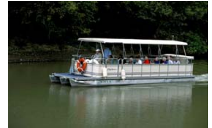
S.S. Ruby boat tours

Fargo and Moorhead were established at their current locations to take advantage of the Red River for commercial use in the form of