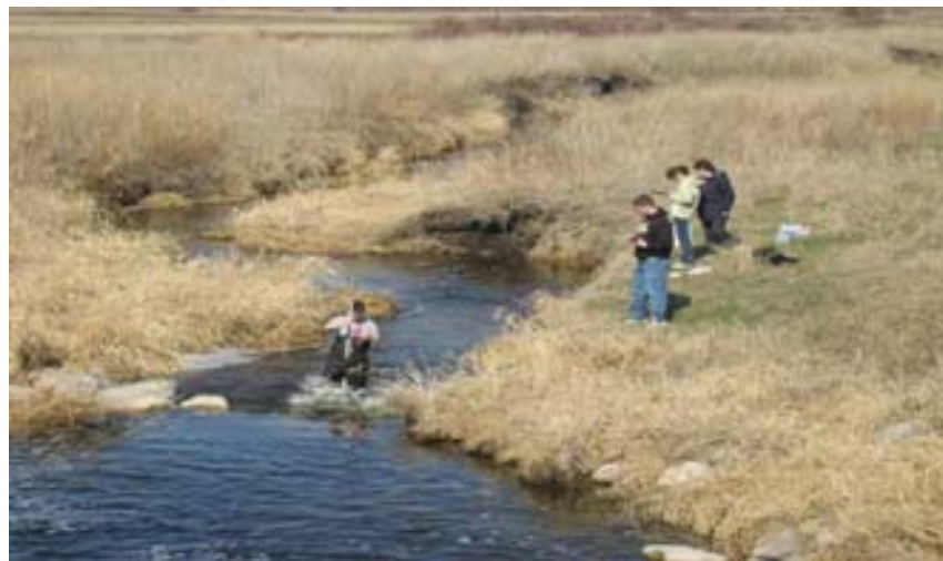
Barnesville River Watch students monitoring Hay Creek.

In the past five years with the leadership of River Keepers through its dedicated members, the State of Minnesota has declared the Red an official Canoe and Boating Route, and printed recreational maps. Last