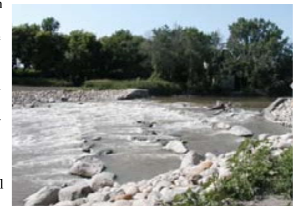
Fargo-Moorhead's North Dam

One dam at a time, the Red River of the North is slowly being reconnected to make it safer for people and healthier for fish and other river life. Since Fargo's Midtown Dam was converted to rapids in 1999, another four dams have been modified and only three of the original nine remain on the Red. This effort along with the removal or modification of another 19 dams on the Minnesota tributaries is restoring critical migration routes and spawning habitat for walleyes, catfish, lake sturgeon and many other species. Dangerous undertows that were responsible for roughly 100 deaths below